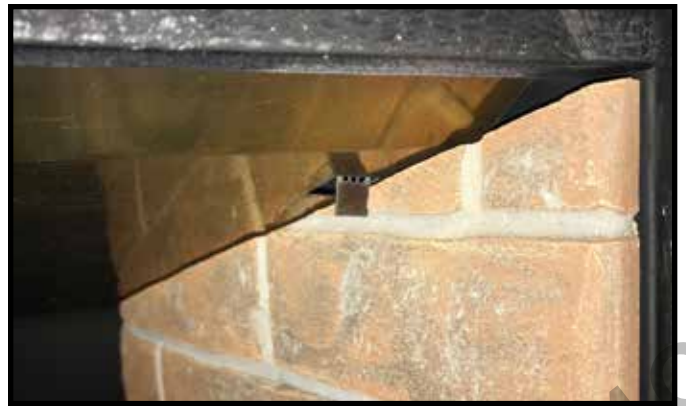
Figure 8. Right Refractory Handbend Tab