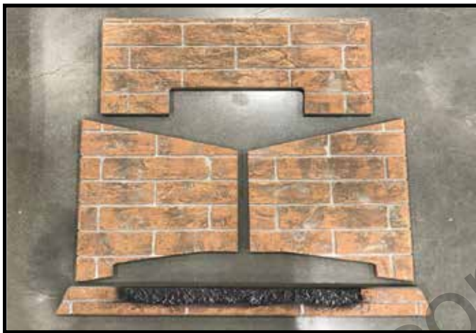
Figure 1. Refractory Kit Components

If replacement panels are needed, the entire kit must be ordered.