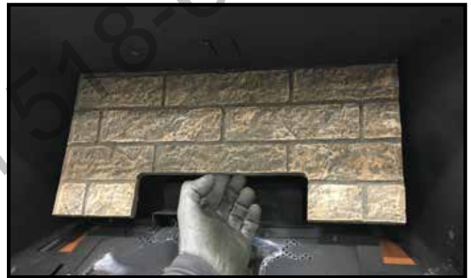
Figure 4. Back Refractory

Be sure to hold back refractory in upright position until side panels get installed.