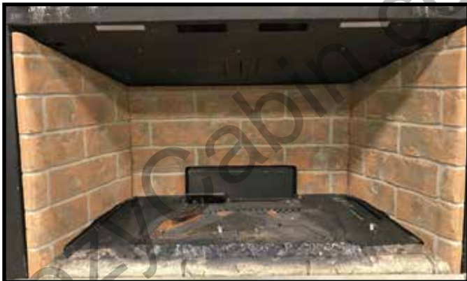
Figure 8. Refractory Kit Installed

Please contact your Hearth & Home Technologies dealer with any questions or concerns. For the location of your nearest Hearth & Home Technologies dealer, please visit www.hearthnhome.com .