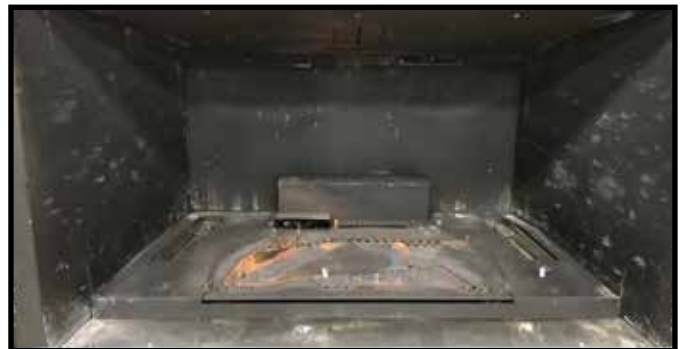
Figure 3. Empty Firebox