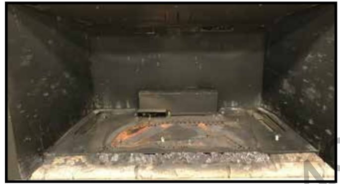
Figure 3. Base Refractory Installed