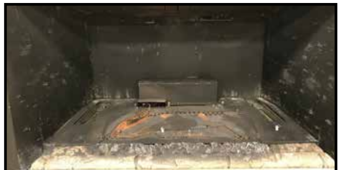
Figure 4. Base Refractory Installed