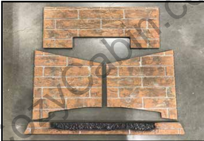
Figure 1. Refractory Kit Components

If replacement panels are needed, the entire kit must be ordered.