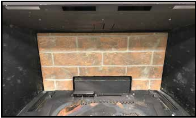
Figure 5. Back Refractory Installed

Be sure to hold back refractory in upright position until side panels get installed.