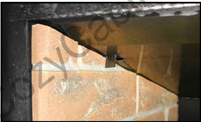
Figure 7. Left Refractory Handbend Tab