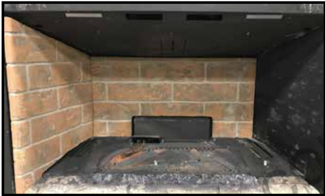
Figure 6. Left Refractory Installed

3. Install left and right refractory, bend down tabs to hold in place. See Figures 6, 7 & 8.