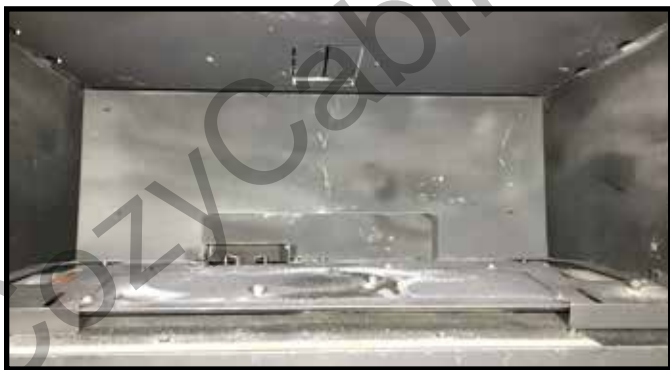
Figure 2. Empty Firebox