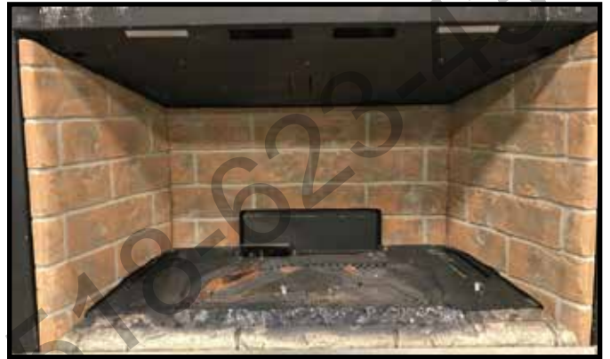
Figure 9. Refractory Kit Installed