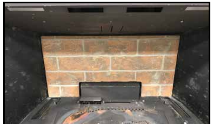
Figure 5. Back Refractory Installed